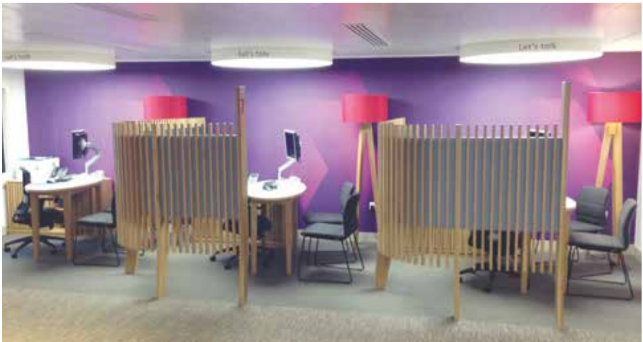
Natwest open consult room

Good acoustic control is desirable in any room to provide a comfortable listening experience, whilst preventing loud background noise. But in a situation where privacy is required, finding a way to direct and control sound is essential. RBS needed to offer customers privacy in a semi-open plan space as well using a solution that was both beautiful and that met with their brand guidelines.