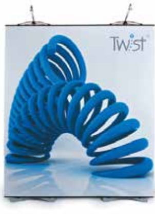
Easi Link Twist