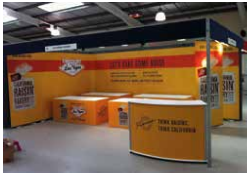
6m x 4m Shell Scheme, 2.25m high