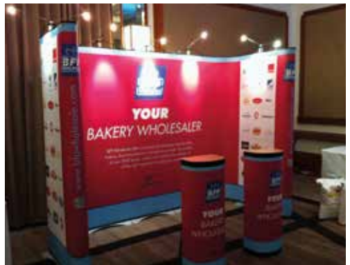
4m x 2m Space, 2.25m high