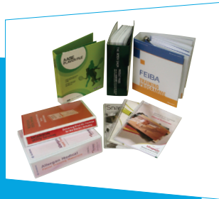
MANUALS AND BINDERS