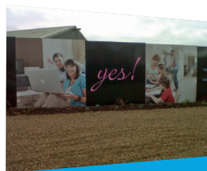
RIGID BUILDING HOARDINGS