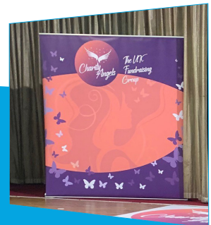
POP UP STANDS