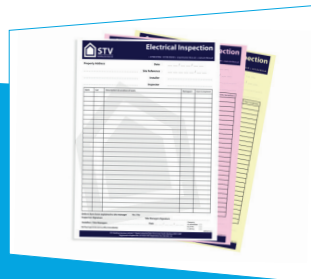
PADS AND NCR PADS