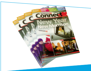
BROCHURES AND NEWSLETTERS