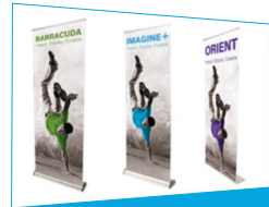
PORTABLE EXHIBITION STANDS