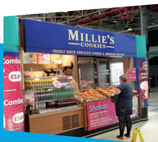
LIGHT BOX PRINTS