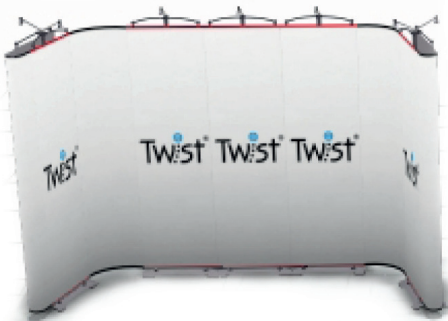
4m x 2m Space, 2.25m high