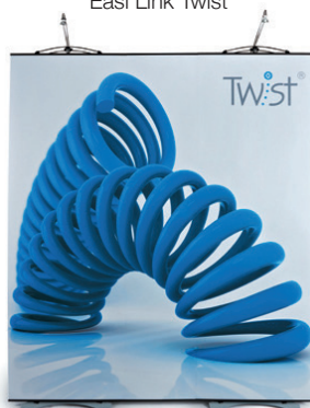
Easi Link Twist